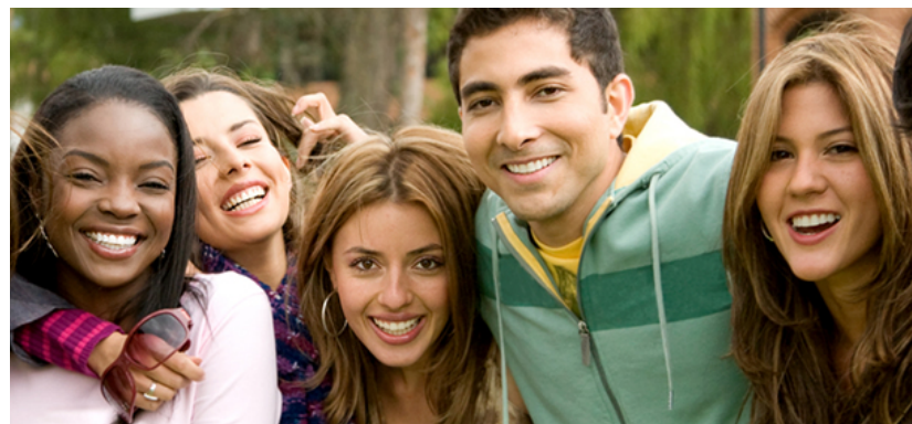
Academic Programmes for International Students