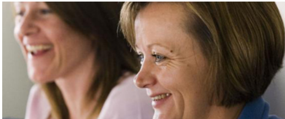
Access to Higher Education & Lifelong Learning