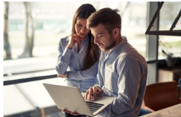
Mid-Career Learning for Work