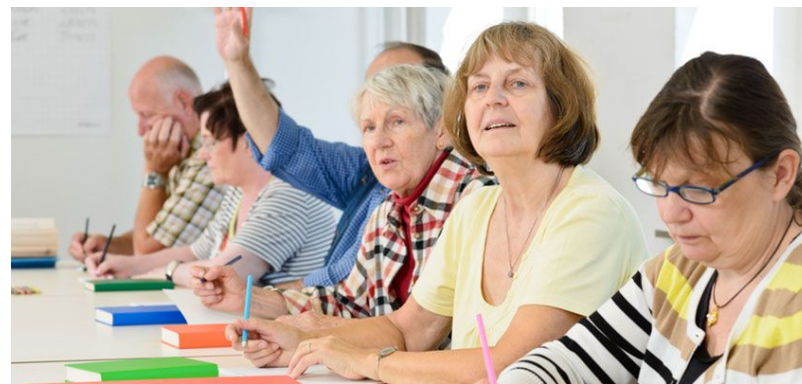
Learning in Later Life